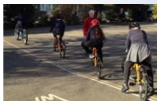
Fleecefield healthy eating workshop