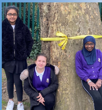
Fleecefield reflecting one year on

Welcome to our Spring Term newsletter! In April, Children First Academy Trust becomes two years old - HAPPY BIRTHDAY TO US!!